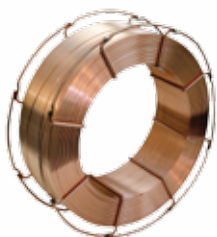
MIG 6000 0.9mm 15kg Spool Code: W033901