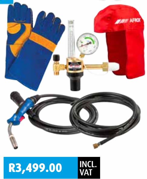
Afrox Industrial MIG 251C 230V Code: W500251