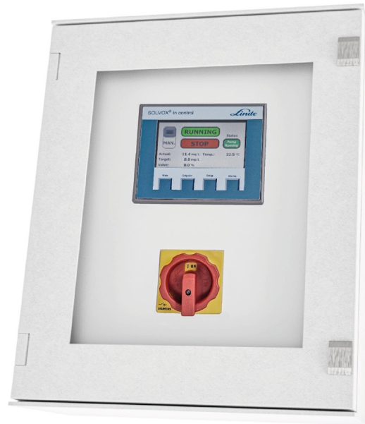
SOLVOX® in control

Introduction SOLVOX® in control is a specially designed injection control system for dosing oxygen to Linde's oxygenation systems, such as our SOLVOX dropin, oxycloud and venturi.