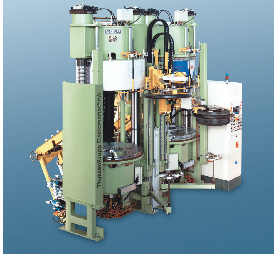
Nitrogen-operated, hydraulic tire press