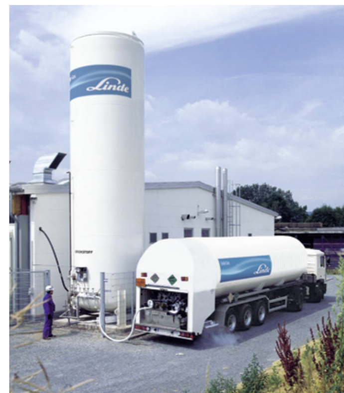
Bulk delivery of liquid nitrogen.

Gas is normally sterilised with a filter at the point of use, but sometimes sterile liquid gas is required. Liquid nitrogen might be thought sterile in itself due to its low temperature. However, it is sometimes used to preserve living microorganisms. No conventional sterile filter can withstand cryogenic temperatures for very long. Linde Gas circumvents this by liquefying sterile filtered gas in its VERISEQ® Sterile Liquid Gas (SLG) system. The VERISEQ® SLG system belongs to the VERISEQ® PGC (Pharmaceutical Gas Concept). It has been designed for use in pharmaceutical production.