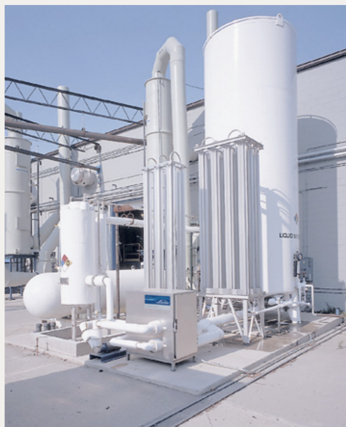
Customer installation of a CUMULUS® PX20 unit.

Gas products – such as liquid nitrogen, liquid carbon dioxide and dry ice – are used to cool various processes and equipment. Cryogenic cooling with gas offers an environmentally-friendly alternative when compared, for example, with mechanical cooling based on halogenated hydrocarbons (HCFCs and CFCs). Many pharmaceutical processes can be enhanced through the use of cryogenic cooling, e.g. grinding, milling, mixing, granulation, freezing, lyophilisation and several others. Temperature control can be integrated into existing processes or equipment to enhance both production and product quality. Some typical parameters are processing times, yield, selectivity, surface structure and particle size. Cooling may be obtained by either direct or indirect contact with a cold-gas flow or with a liquid gas. In cases where the pharmaceutical product must be in direct contact with the cooling medium, Linde Gas can provide sterile liquid gas.