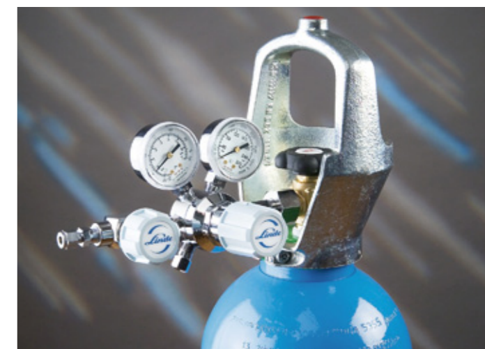
BASELINE C106 single stage cylinder regulator