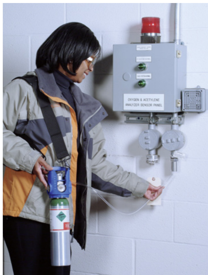
Linde Gas received the 2004 Gases and Technology Magazine Product Innovation Award for gas delivery systems with ECOCYL ® – a portable, refillable, integrated calibration gas cylinder and gas delivery system.

Pure oxygen is commonly used in biological wastewater treatment plants to improve aerobic activity, which reduces dissolved oxygen (DO) levels and unpleasant odours. Oxygen can also prevent the formation of hydrogen sulfide in buffer tanks, lagoon piping and sewerage systems. Where standard biological treatment is not applicable, Linde Gas also offers solutions employing wet oxidation.