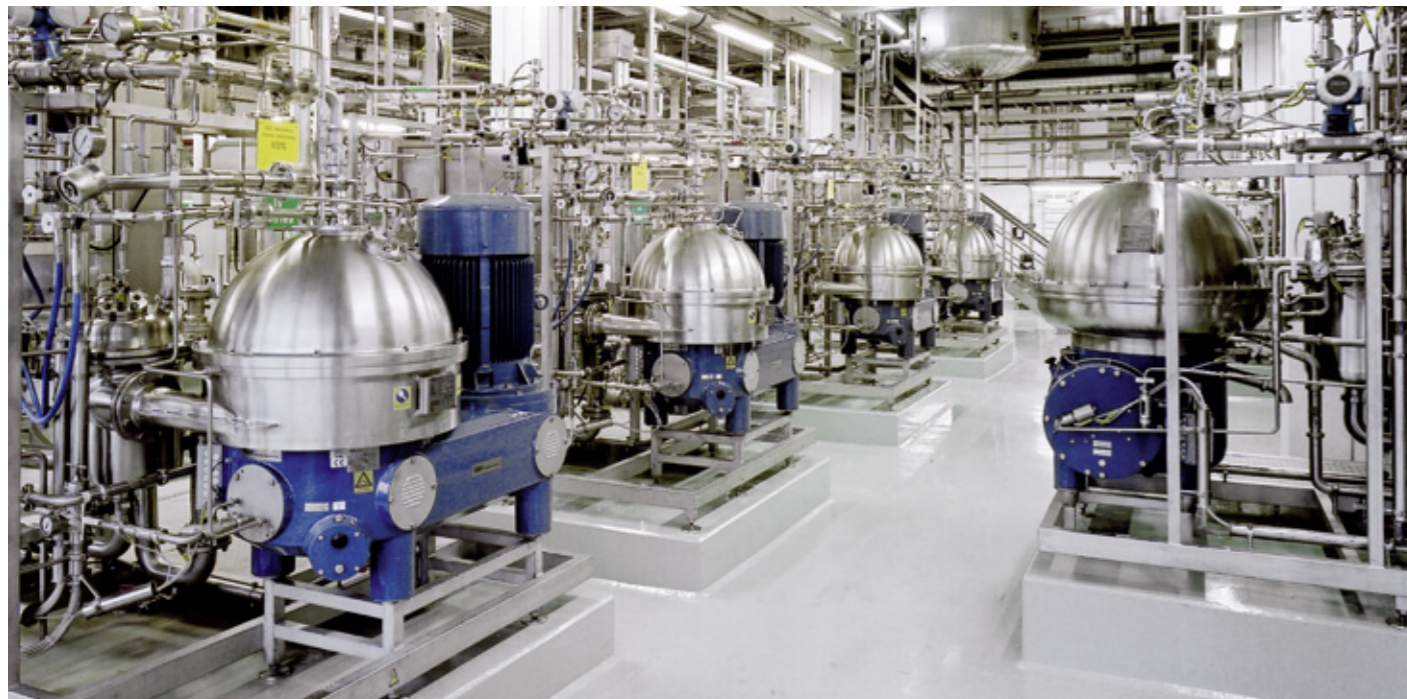
Interior of a large-scale biopharmaceutical plant, designed and constructed by Linde-KCA-Dresden.

through all phases, from front-end studies or conceptual designs up to the hand-over of completed plants. At Linde-KCA-Dresden, we have the flexibility to provide either selected services or take on full responsibility for engineering, project management, procurement, construction management and commissioning – including all stages of qualification (DQ, IQ, OQ) and validation assistance.