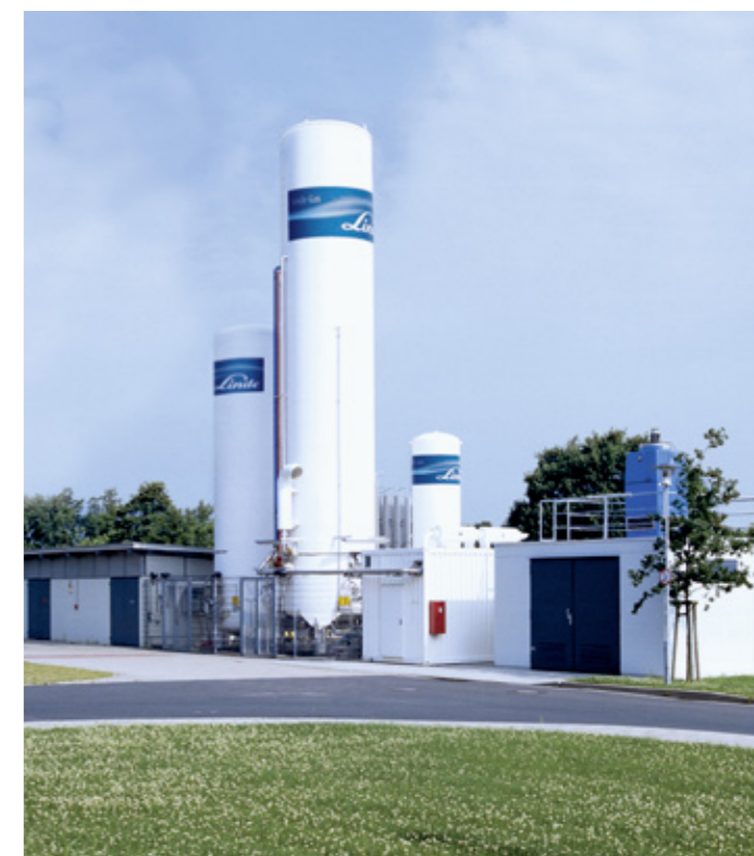
On-site supply with the ECOVAR® system.