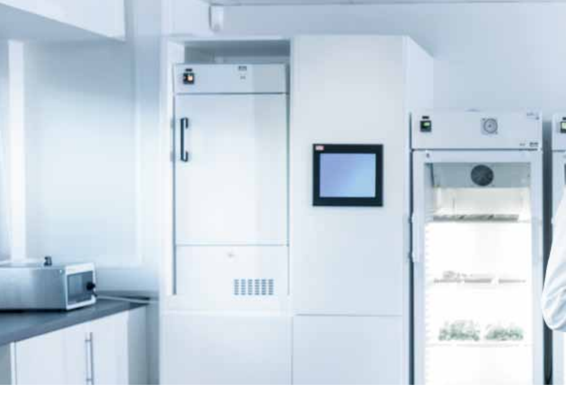
Scientists working in food packaging laboratory.