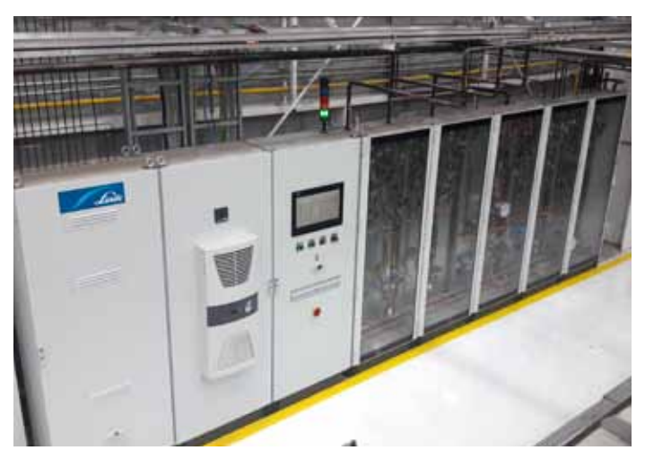
The CARBOFLEX control cabinet: the gas flow adjusts automatically to maintain atmosphere composition within set limits.