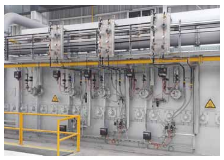
As an essential part of the installation, CARBOCAT® in-situ catalysts are used to produce high-quality endothermic gas.

The custom-built CARBOFLEX system was thus shipped to Mexico in 2017, installed in 2018 and went live in February 2019. Linde provided a complete package extending from process consultancy through