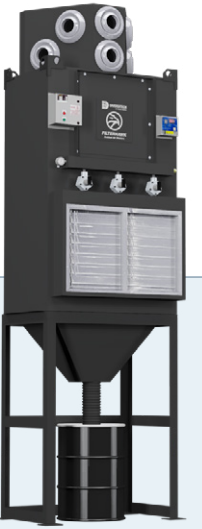
StormTower Ambient Collector StormTower Pro Ambient Collector